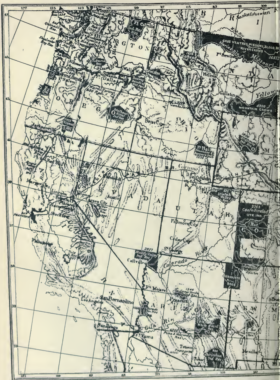
INDIAN RESERVATIONS IN 1874 A